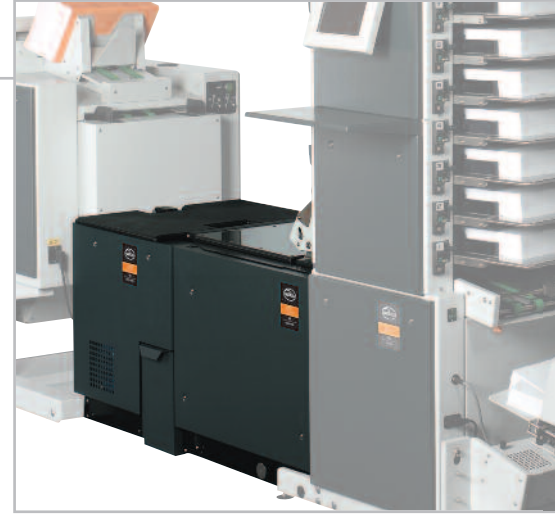
Automatic Stitch-Fold and Trim

The patented clamshell design makes the Automatic Stitch-Fold remarkably compact. It provides the collated set with a near vertical infeed paper path, resulting in well aligned sheets and accurate books every time. It also makes it suitable for books that have mixed sheet sizes - an A4 booklet, with a loosely bound flat A4 sheet inside, is an example.