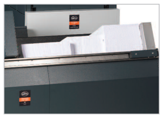
Stack different sized books without adjustment

The PBS complements the PowerSquare's capability for thick books and high volume production by streamlining the entire operation. The operator can set the machine running and simply walk away.