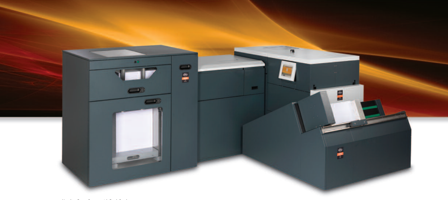
Nearline PowerSquare with Book Stacker